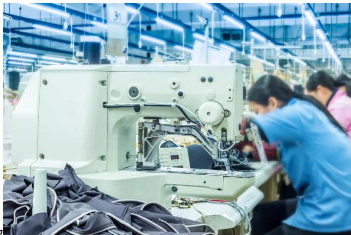
Production & Planning