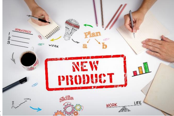
Product Design & development