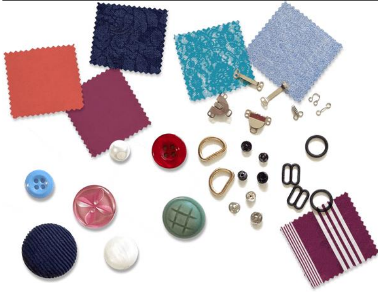
Suitable Material Sourcing