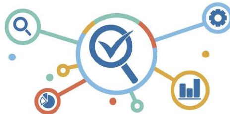
Risk assessment & Quality Control